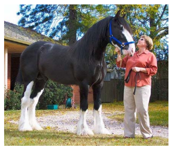
satisfying, although occasionally they do break your heart.

I am looking forward to (very soon) riding and driving my very own equine mac-truck through the fields and along the trails that lead from my house into the nearby state forest.